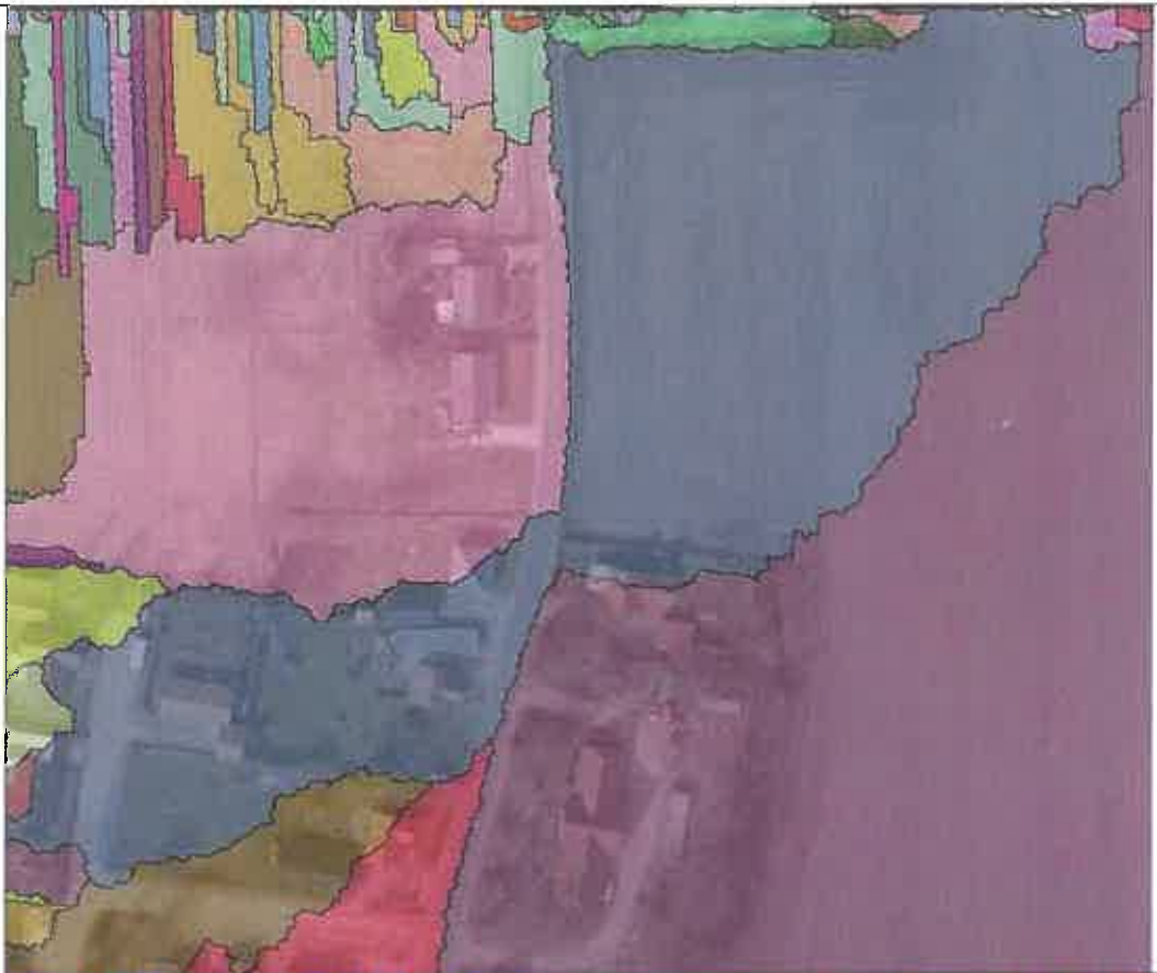
Figur 1 Status vandoplunde